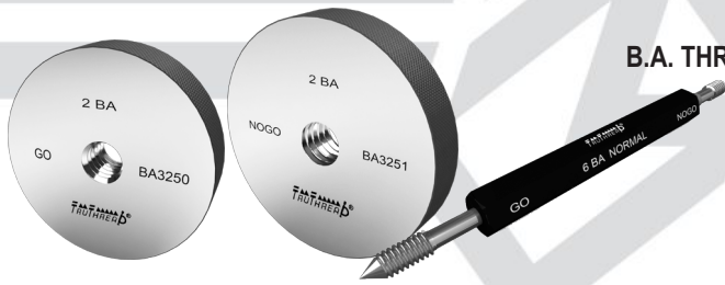
B.A. THREAD PROFILE

Application : B.A. threads are used for fine fastening, especially in instruments.