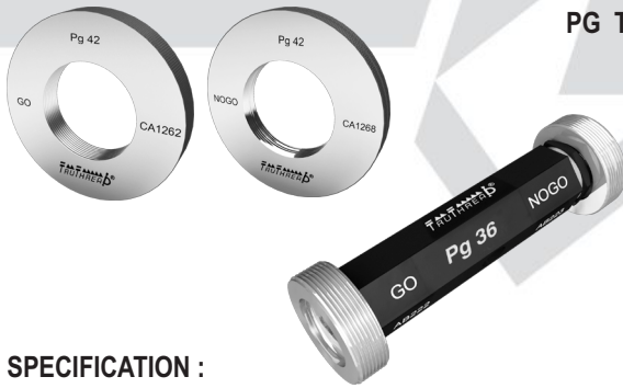
PG THREAD PROFILE

Application : Used for checking threads of conduit pipes used for electrical wiring.